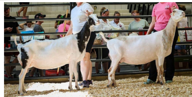
GCH Here Be Goats SFC Marley 6*M EX 91 EEEE and her two-year-old daughter, GCH (pending) Here Be Goats HMN Mirage 7*M

When trying to feed and manage your herd, hay is the foundation! If you do not feed top quality legume-based hay, you will not have goats that perform. Grain is never a substitute for great hay. Also, when trying to learn AI, be patient! Don't breed too soon, if they are flagging 12 hours later, use a 2nd straw rather than wasting a heat cycle.