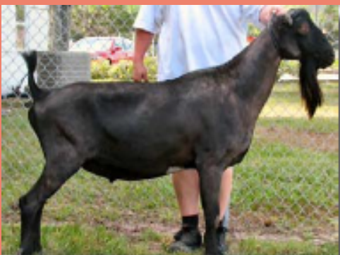
CH Devonshire Luna Negra

Remembering our past years to build for the future!