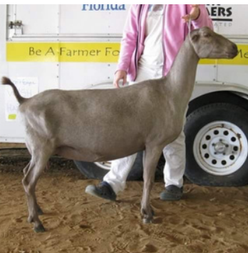
GCH Here Be Goats Dutch Martini Kelley's first homebred permanent champion doe.

Big, wide flat rumps. Without them, it is a kidding nightmare. Correct shoulder assembly with legs that are under the withers that track straight and correct on the move as well.